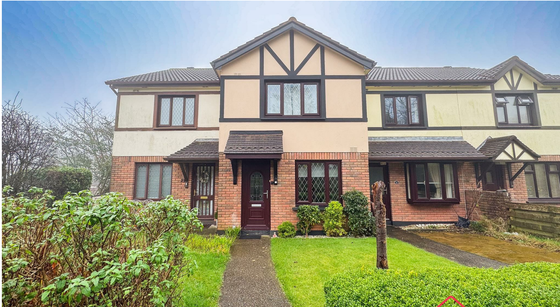
22 Reginald Mews, Douglas, Isle Of Man, IM2 7AN Asking Price £287,500