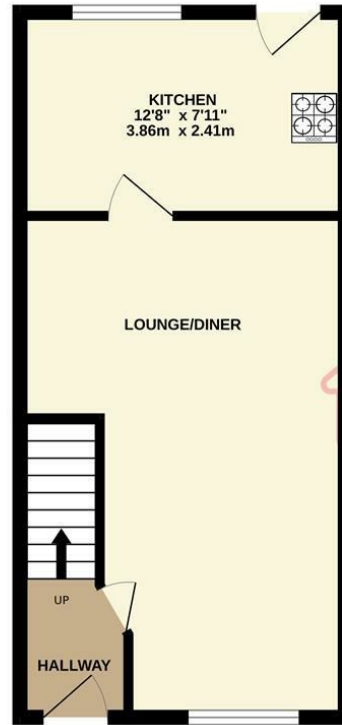
1ST FLOOR 347 sq.ft. (32.2 sq.m.) approx.